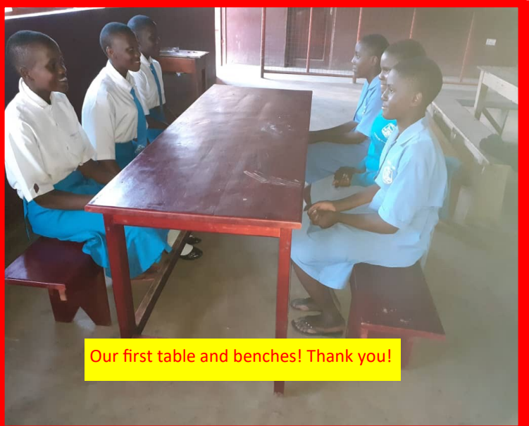
Our first table and benches! Thank you!