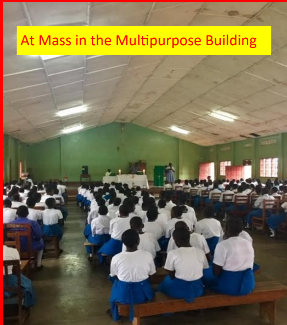
At Mass in the Multipurpose Building