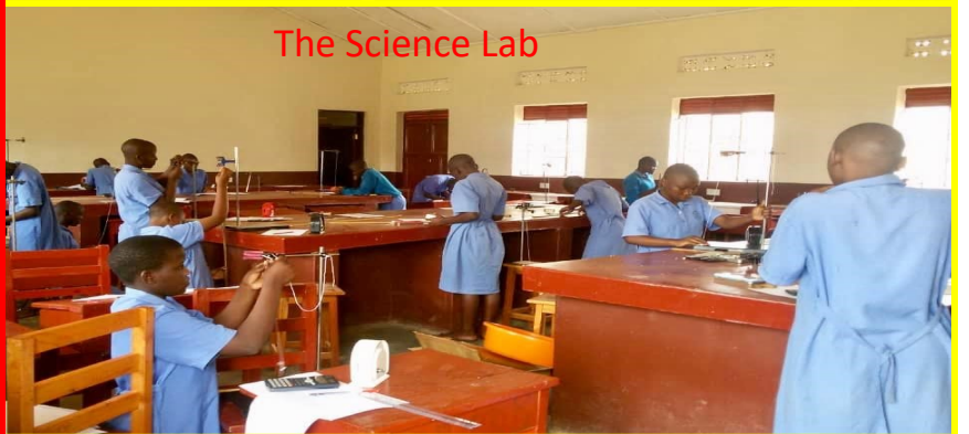
The Science Lab

Thank you for your very generous donations! Sister appreciates all you have done for her girls. Future donation checks should be made out to St. Mary by the Sea Church and mailed to: