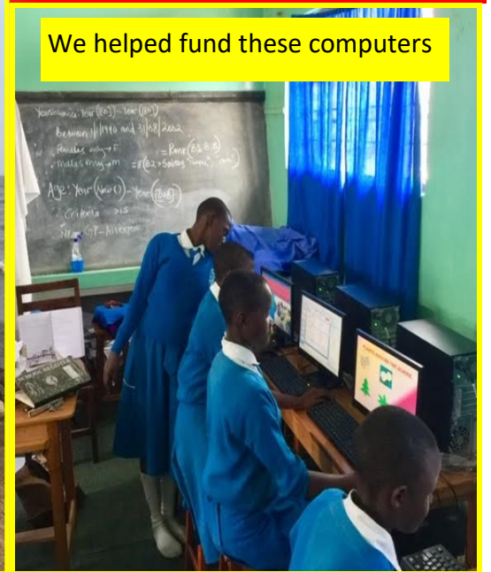
We helped fund these computers