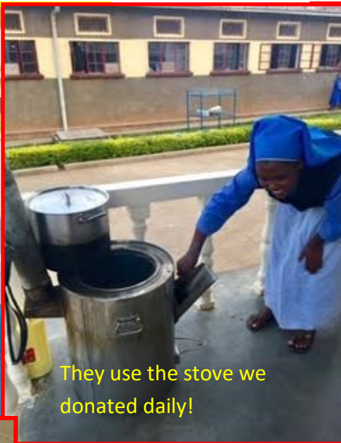
They use the stove we donated daily!