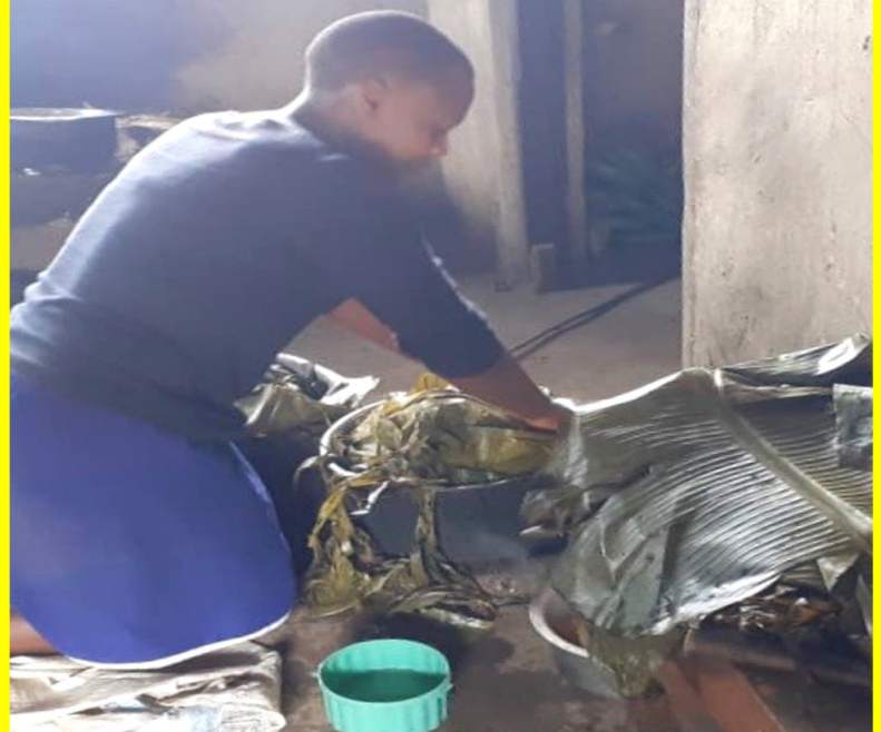
Smashing steamed bananas to make Matooke