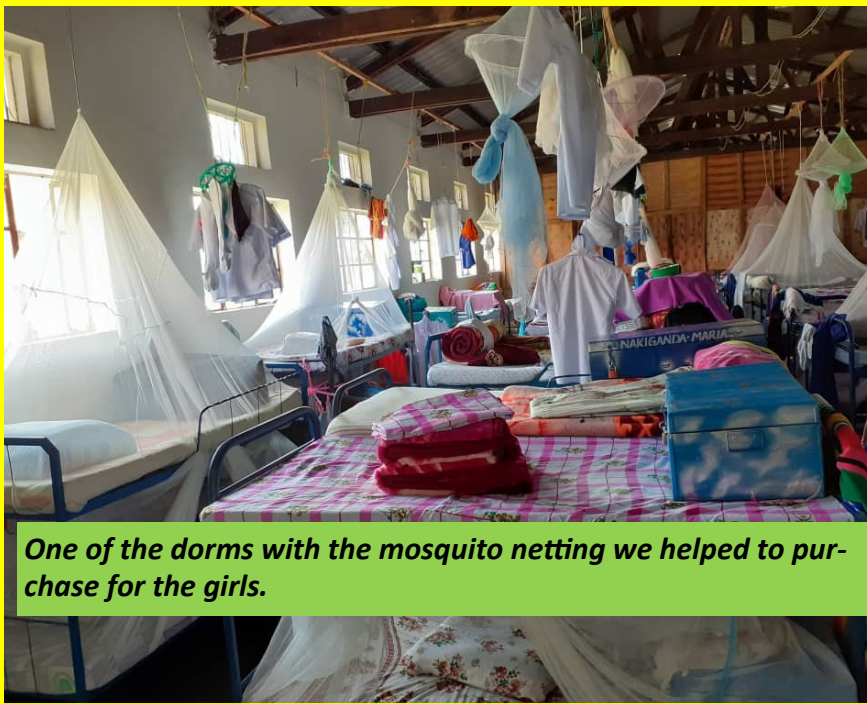
One of the dorms with the mosquito netting we helped to purchase for the girls.