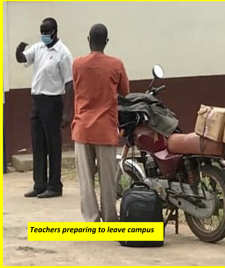
Teachers preparing to leave campus

Thank you for your very generous donations! Sister appreciates all you have done for her girls. Future donation checks should be made out to St. Mary by the Sea Church and mailed to: