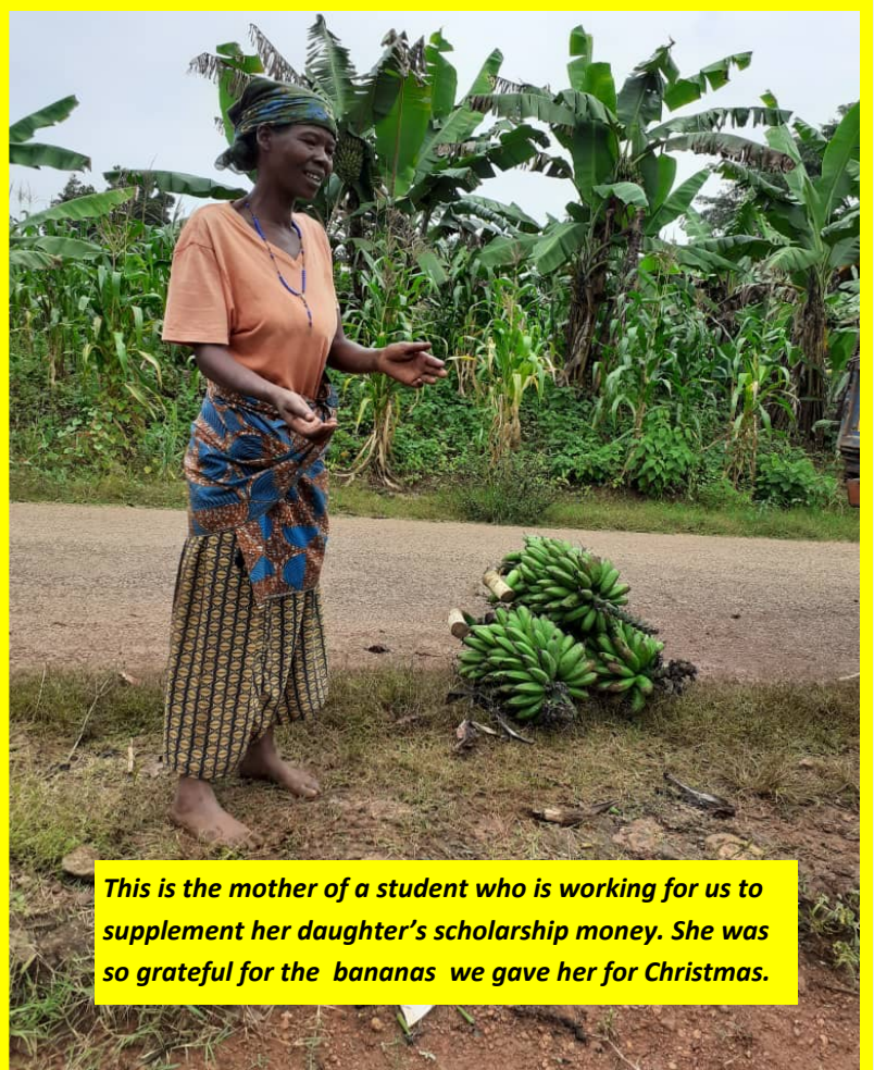
This is the mother of a student who is working for us to supplement her daughter's scholarship money. She was so grateful for the bananas we gave her for Christmas.