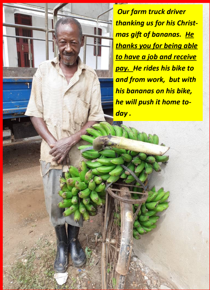
Our farm truck driver thanking us for his Christmas gift of bananas. He thanks you for being able to have a job and receive pay. He rides his bike to and from work, but with his bananas on his bike, he will push it home to-day .