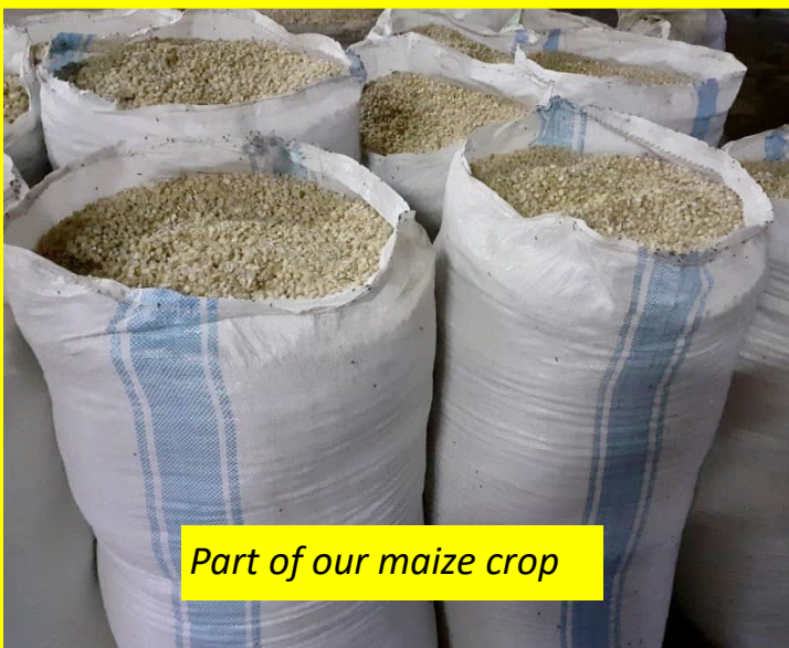
Part of our maize crop