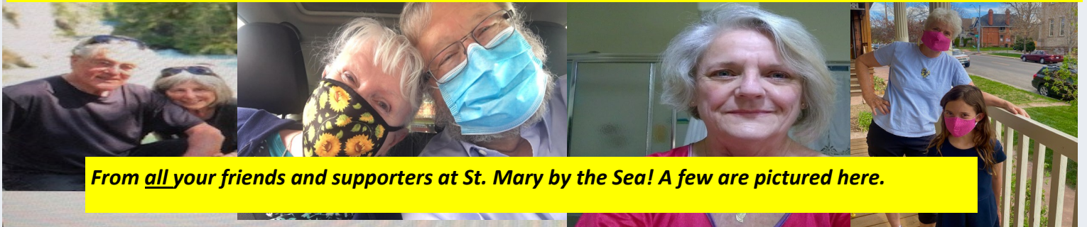
From all your friends and supporters at St. Mary by the Sea! A few are pictured here.

Thank you for your very generous donations! Sister appreciates all you have done for her girls. Future donation checks should be made out to St. Mary by the Sea Church and mailed to: