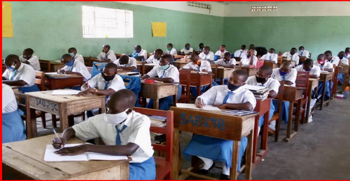
*Sending prayers and best wishes and, most of all, love, to all the students and teachers at St. Aloysius*