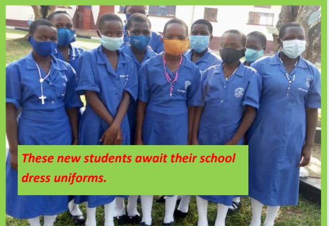
We have twins at our school!