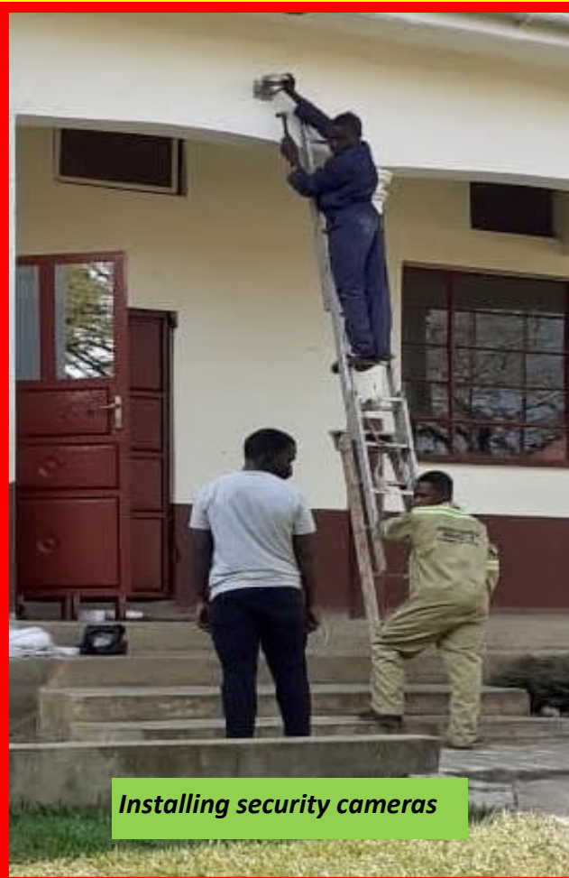
Installing security cameras