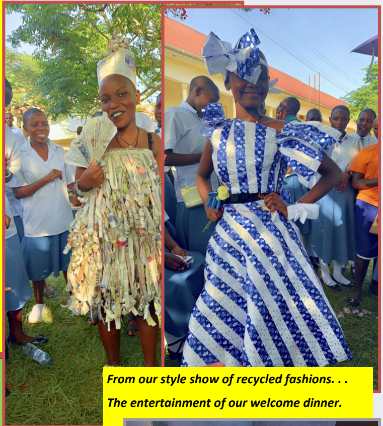
From our style show of recycled fashions. . . The entertainment of our welcome dinner.

S1's (seventh grade) students are loving their new uniforms! They will wear these same uniforms for four years. The skirts are wrap arounds so they will always fit. Once the girls are 11th graders they will be given light blue skirts and ties.