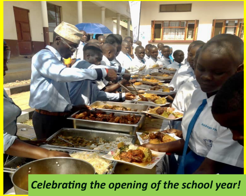
Celebrating the opening of the school year!

This busy week we have also received bad news of the passing of one of our parents whose daughter is in 11th grade. I have frequently been in touch with this mother as she had been struggling to look for fees for her daughter and at the same time to look for her own medical fees. She had been suffering from cancer and now has passed away. It's quite challenging as tomorrow will also