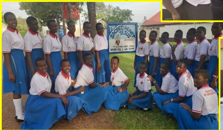
Weebale! Thank you, Friends!