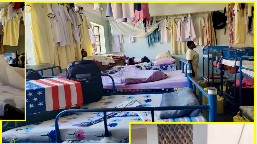
Dorm life at St. Aloysius!