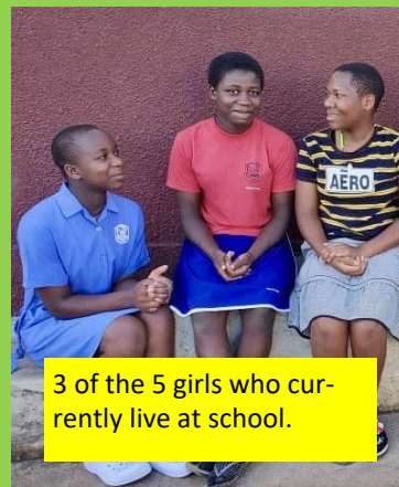
3 of the 5 girls who currently live at school.