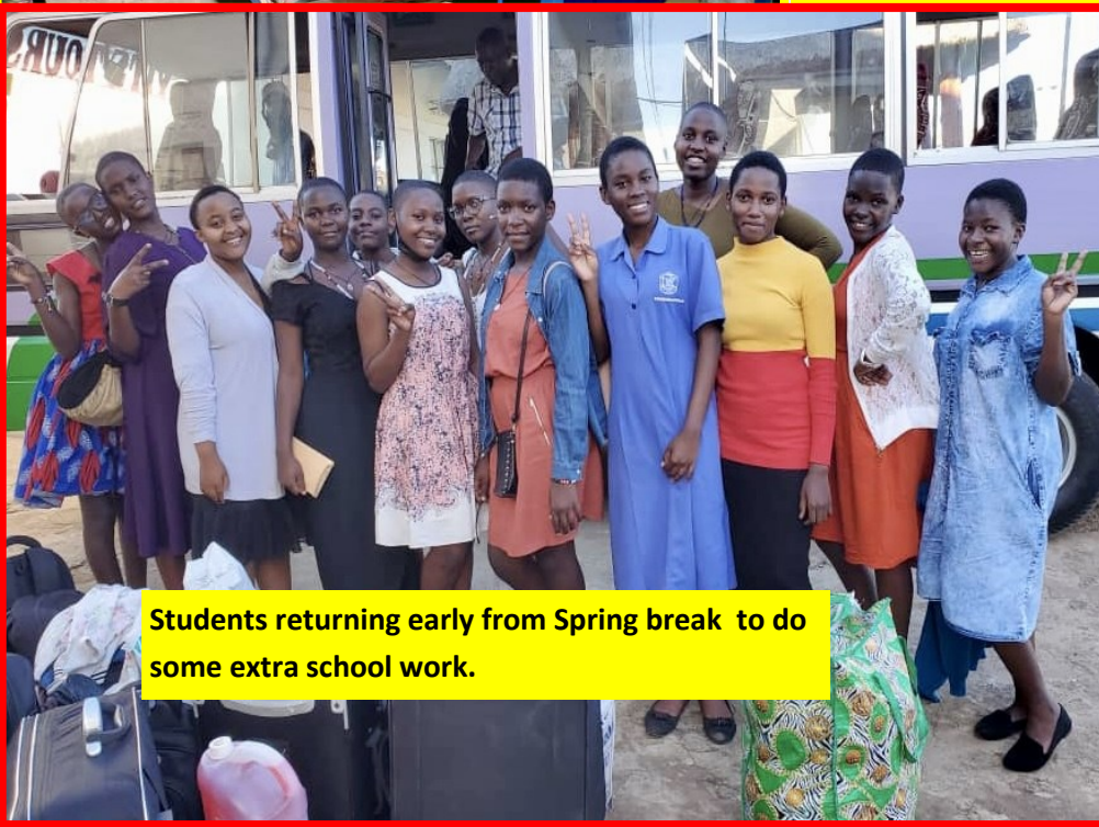
Students returning early from Spring break to do some extra school work.