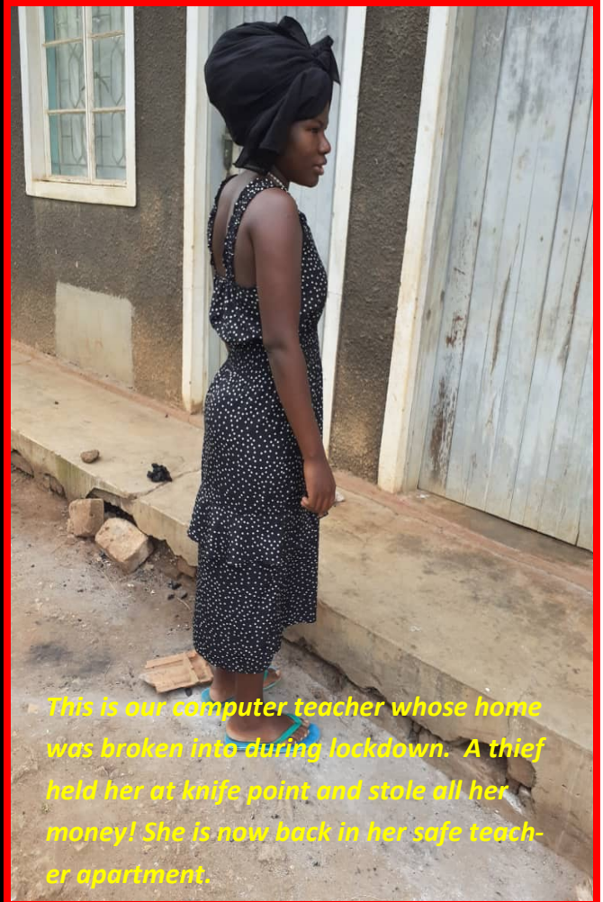
This is our computer teacher whose home was broken into during lockdown. A thief held her at knife point and stole all her money! She is now back in her safe teacher apartment.