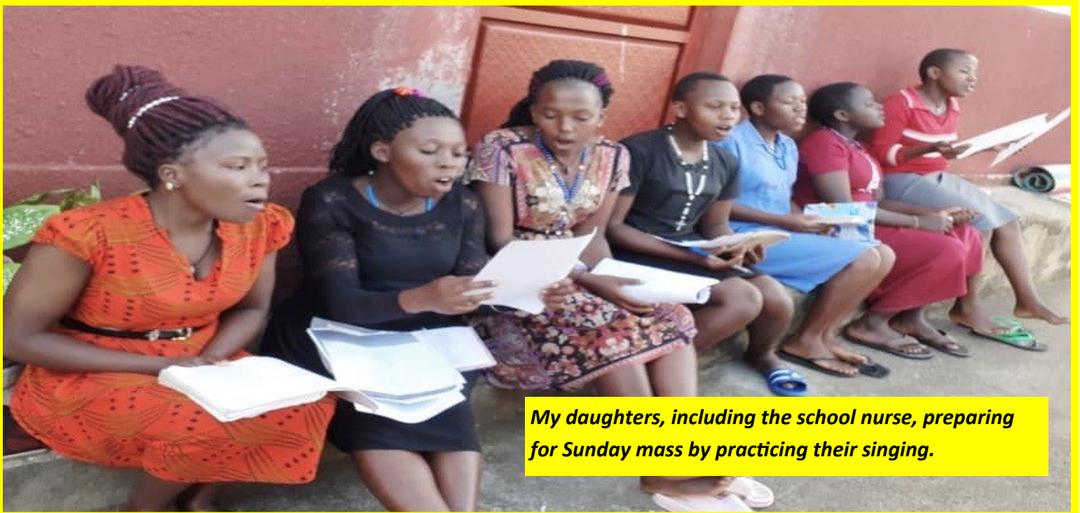
My daughters, including the school nurse, preparing for Sunday mass by practicing their singing.