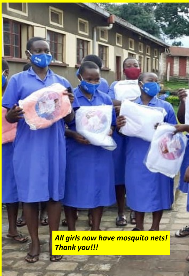
All girls now have mosquito nets! Thank you!!!