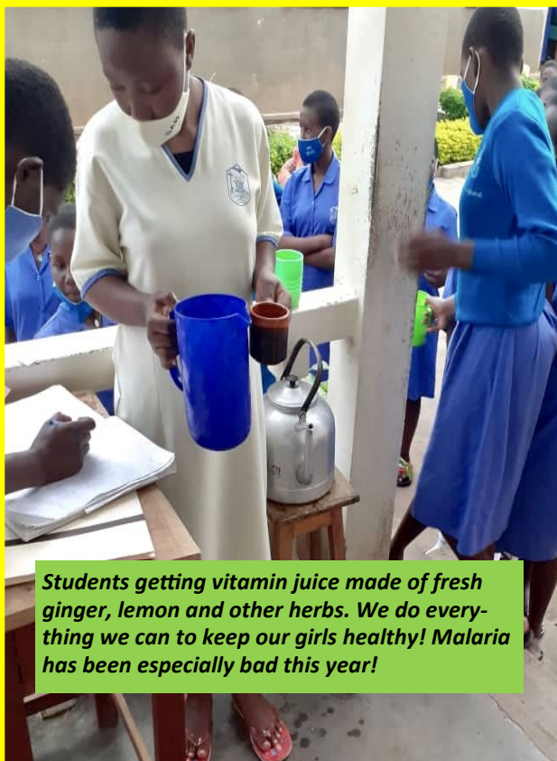
Students getting vitamin juice made of fresh ginger, lemon and other herbs. We do everything we can to keep our girls healthy! Malaria has been especially bad this year!