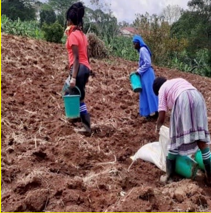
After we had the field plowed (thank you again!) 2 girls and a sister are spreading manure to enrich our soil!