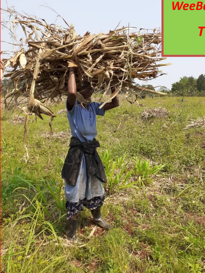
This mother is incredibly dedicated to her daughter's education! We are grateful for her help!