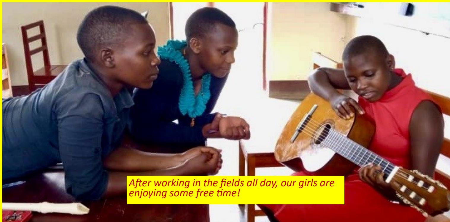
After working in the fields all day, our girls are enjoying some free time!

You are in our prayers . . . Sister Immaculate