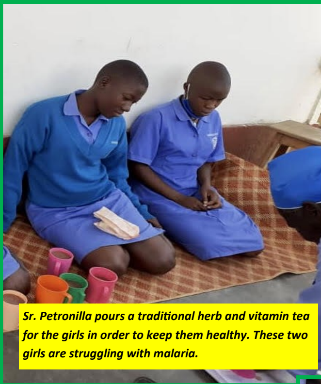
Sr. Petronilla pours a traditional herb and vitamin tea for the girls in order to keep them healthy. These two girls are struggling with malaria.