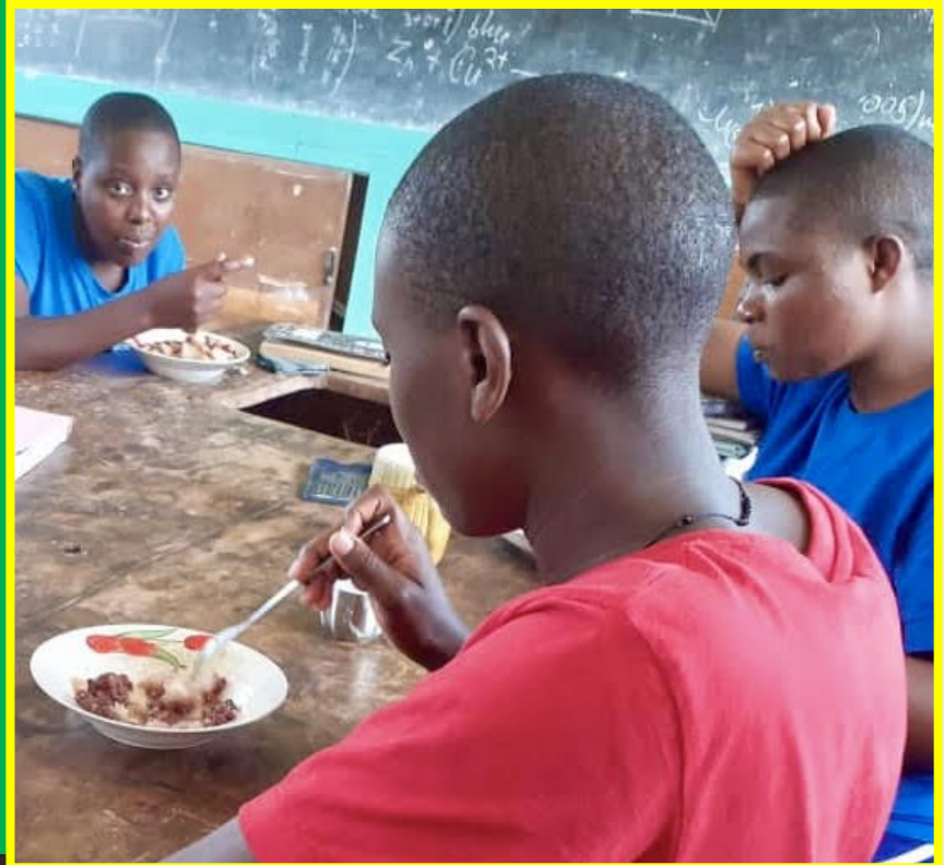
Poshu and beans.