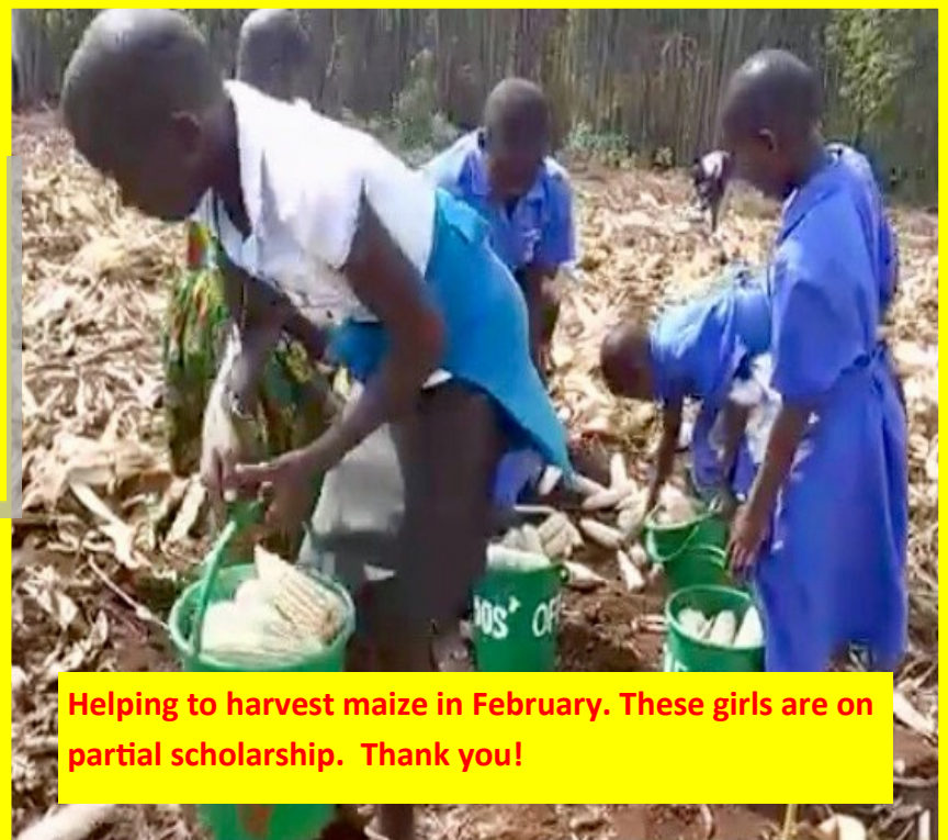
Helping to harvest maize in February. These girls are on partial scholarship. Thank you!

Happy Easter Everyone!! He has risen! Alleluia!!