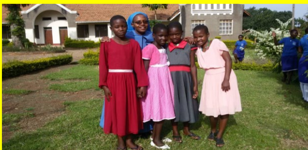
Their very first day of school!! January 2019

Happy Easter Everyone!! He has risen! Alleluia!!