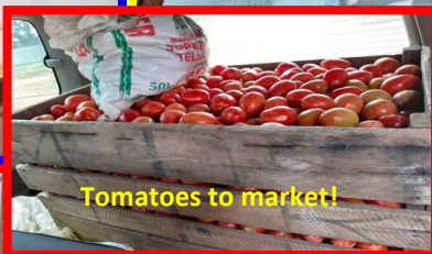
Tomatoes to market!