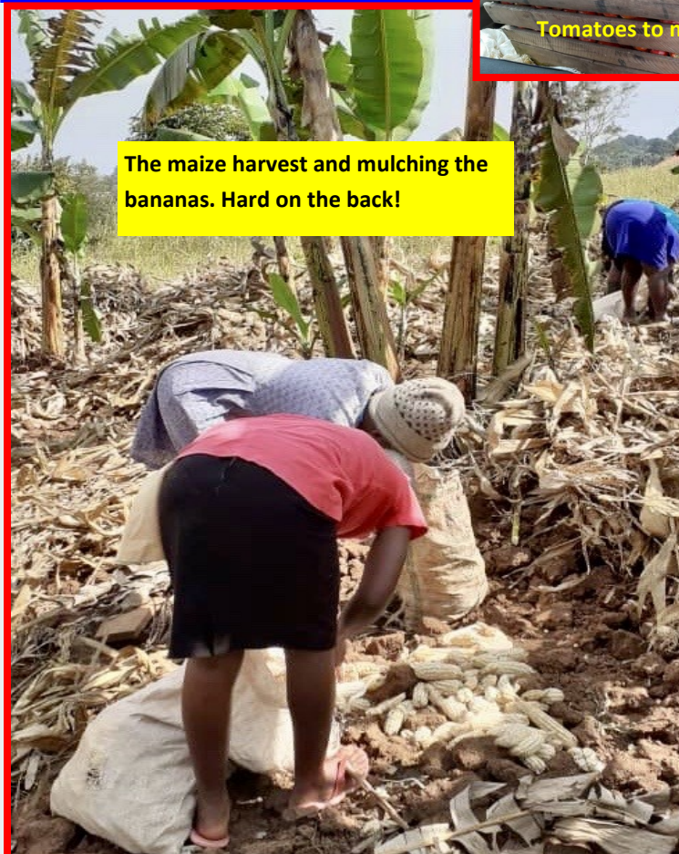
The maize harvest and mulching the bananas. Hard on the back!